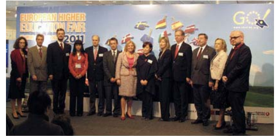
Representatives of participating countries at Opening Ceremony of EHEF 2011