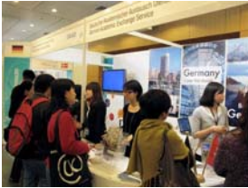
DAAD Booth at EHEF 2011