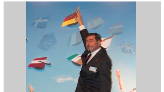
German Consul General Werner-Hans Lauk inaugurating EHEF 2011.

The After Fair Report with more detailed information will be available for download on the EHEF 2011 official website in June.