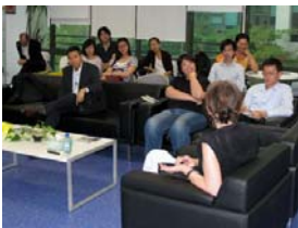
DAAD's first talk at Hong Kong Institute of Education.