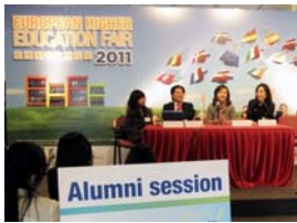
Alumni sharing their study experience in Europe