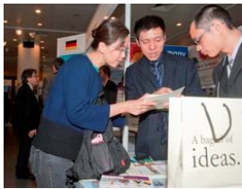
Visitor inquiring studies in Baden-Württemberg, Germany.