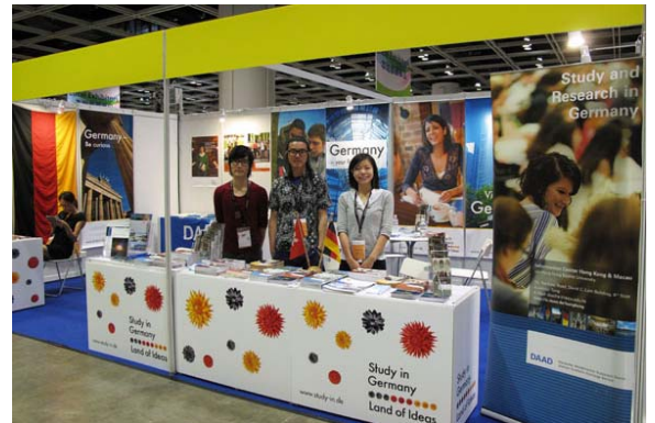
Germany Booth at the International Education Forum and Expo (IEFE) - DAAD shared the booth with Goethe Institut Hong Kong.