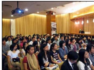
Students at the Pre-departure Briefing talk