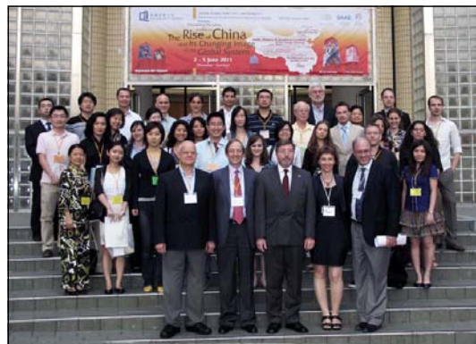
Participants and organizers from The Rise of China and Its Changing Image in the Global System Conference

Date: 2-5 June 2011 (Thu - Sun) Venue: Hong Kong Baptist University