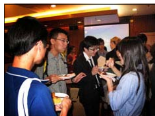
Student networking while enjoying German delicacies