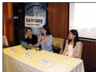
Alumni sharing session